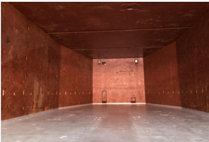
Hold looking forward Showing narrowing over 8.1 m to 8 m

Dangerous goods fitted Grain Fitted Heavy cargo fitted El Vent